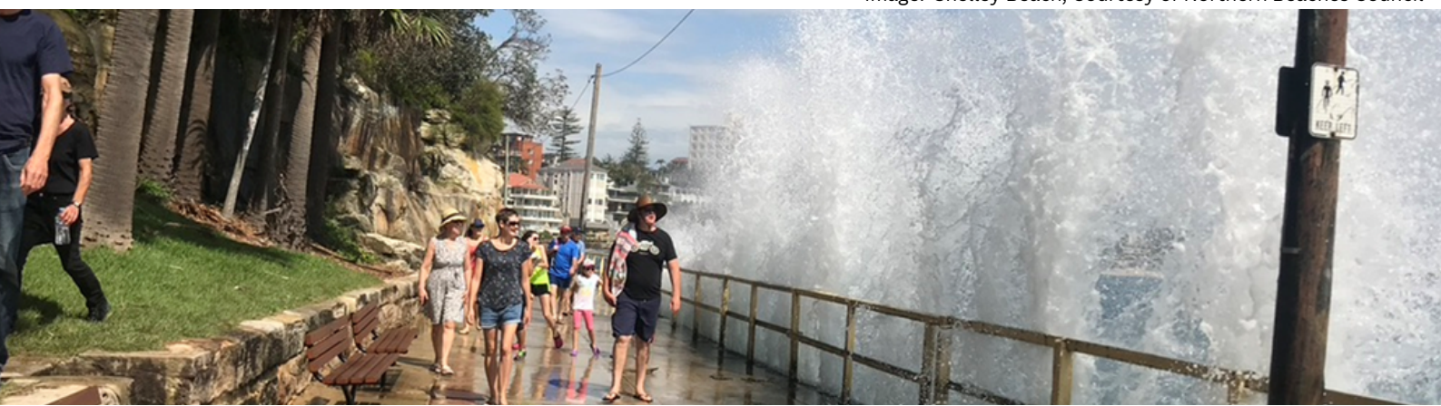
Image: Shelley Beach