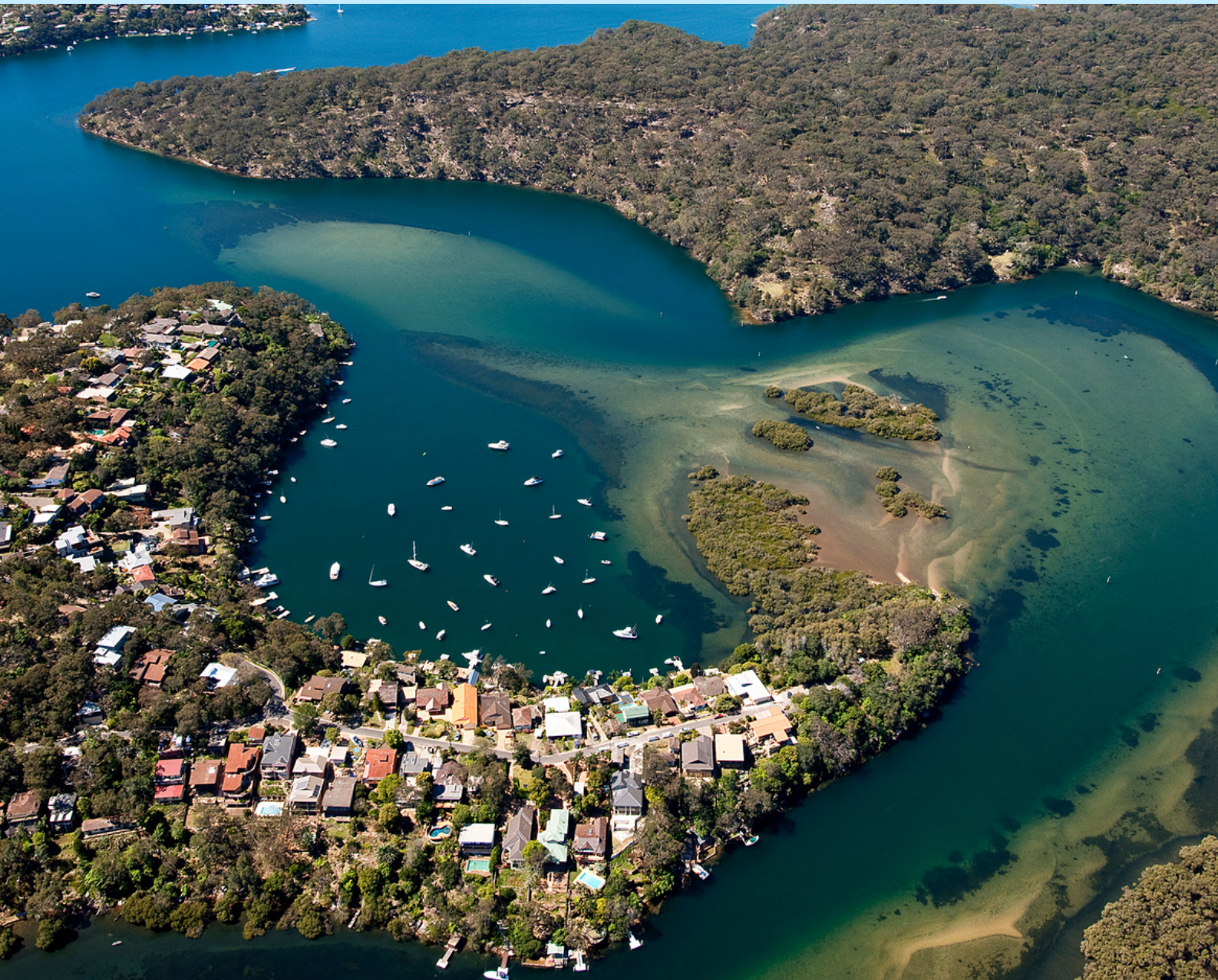
Image: Port Hacking River

These presentations have guided representatives on coastal processes, information availability and potential management strategies for the ongoing threats posed by sea level rise and beach erosion.