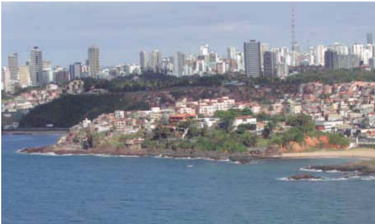
A typical coastal city skyline in Brazil.