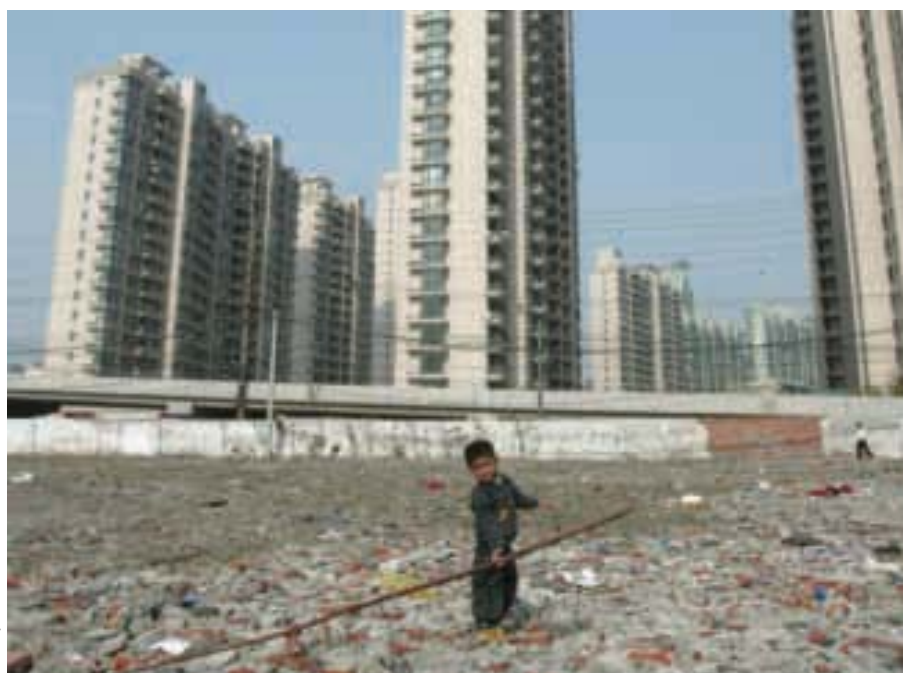
Child playing by housing complex in Shanghai, China.

ECP emphasizes the importance of integrating implementation mechanisms. This would ensure that statutory plans, such as the urban master plan, and plans that reflect long-established administrative practice, such as the five-year investment plans and supporting sector plans, are all covered under the ‘umbrella’ of the municipal Eco City Plan. Because the ECP is supported by both the local executive and administrative bodies, departments make their decisions on investments, programmes and activities in a way that is consistent with its aims, priorities and the principles.