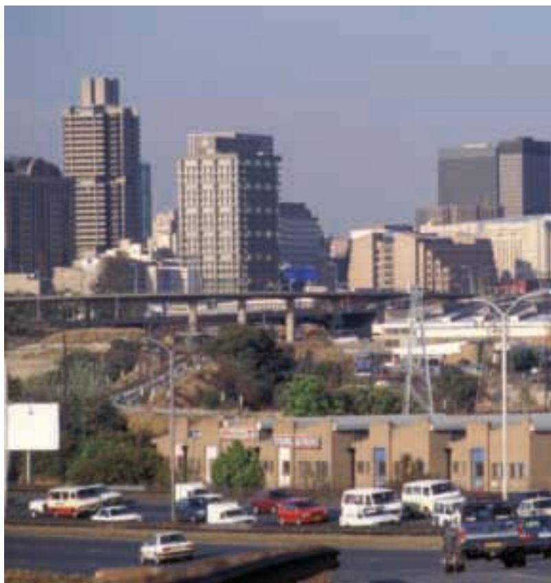
Street scene in Johannesburg, South Africa, where the IDP methodology was used.

IDP is a recent approach. It is technically sound but can be difficult to put into practice.