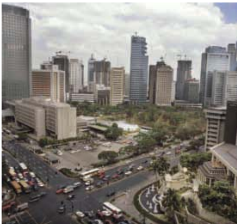
The Manila skyline.