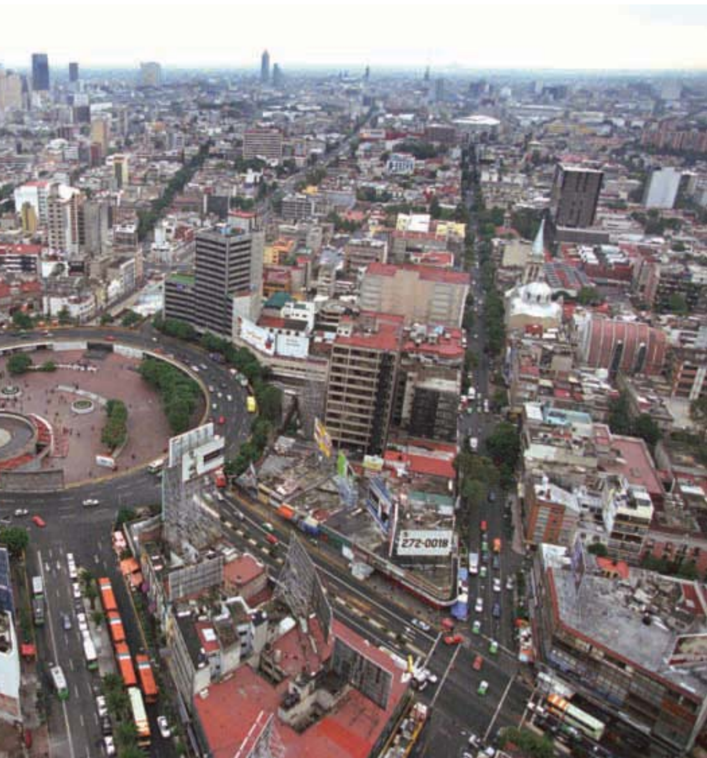
Urban Sprawl in Mexico City