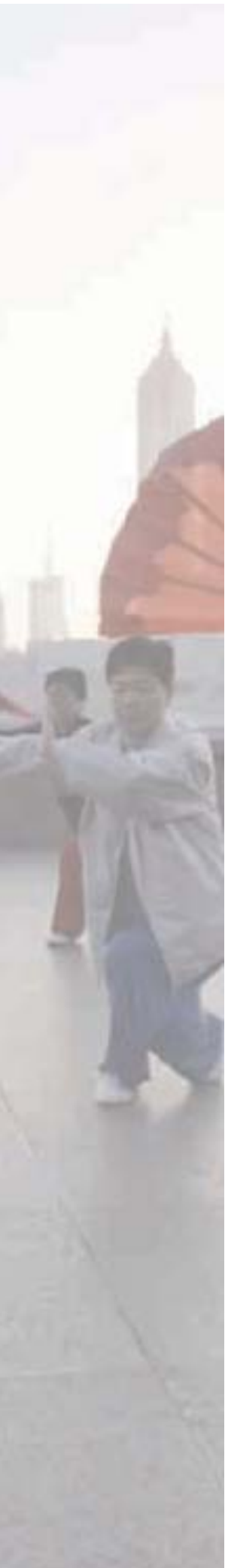
Women with the Tai Chi before the skyline of Pudong in Shanghai, China.