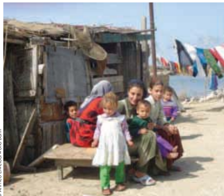
Families of Lake Marriout fishermen.

The solid, multi-stakeholder CDS team played an important role. The team, which included