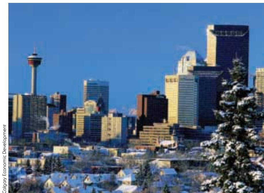
Calgary Economic Development