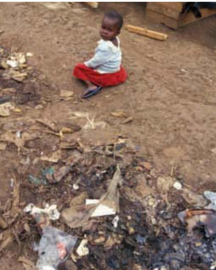
Children were most at risk from the cholera outbreak of 2000.

ing groups stressed environmentally conscious development, promoting Nakuru as a “People’s Green City.” Nakuru was envisioned as: