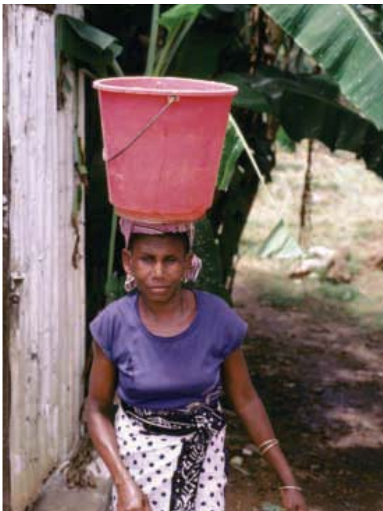
Water shortage is a major problem in Nakuru, Kenya.

increased pressure on municipal services, a factor that is responsible for the low quality of service delivery as demand has outstripped available capacity. Several industries in the area provide important employment opportunities for Nakuru residents—factories are producing cooking oil, batteries, blankets, and agricultural implements—but some of these facilities emit toxic effluents which find their way to the Lake. A five-year integrated Lake Nakuru National Park Plan (2004–2009) initiated by the municipality is designated to address this and other concerns.