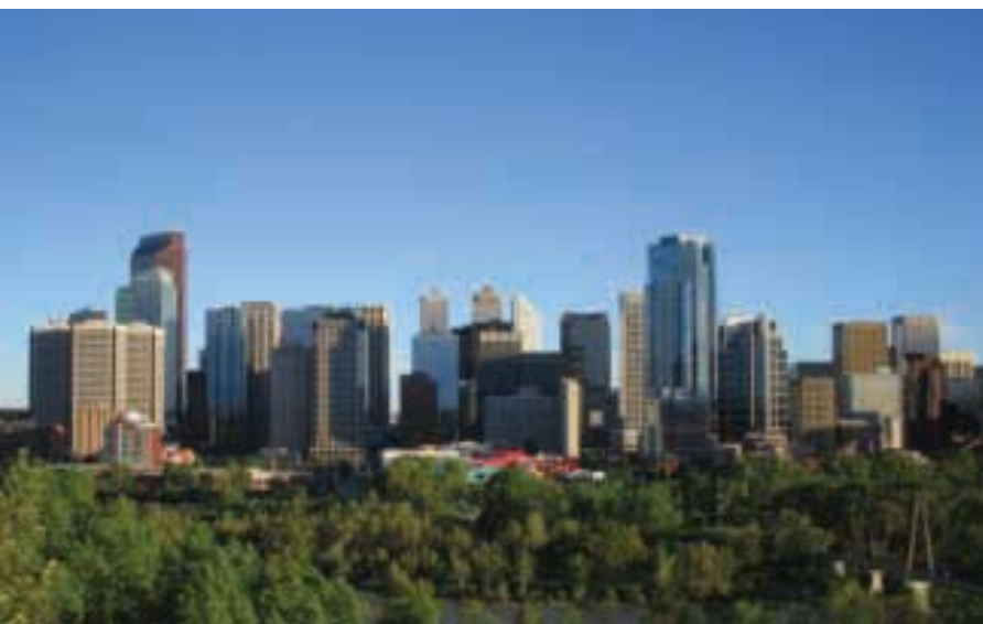
Calgary Economic Development

imagineCALGARY, a city-led, community-owned initiative.