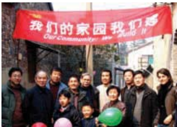
Community power in city planning in Yangzhou.

One of the challenges that Yangzhou encountered is that preparation of the ECP took four years and required the expertise of external consultants. There is still room for improvement in terms of the quality and quantity of public involvement in the entire planning process.