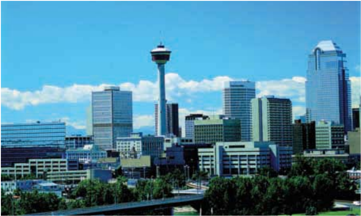
Calgary Economic Development, 2007