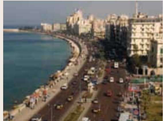
Aerial view of Alexandria, Egypt.

strategic plan. Transparency, in this context, led to the formulation of teams and working groups taking care of the various components of the plan. The full participation of all community stakeholders led to the utilisation of local potential and created a community spirit that has ensured the success of CDS' implementation.