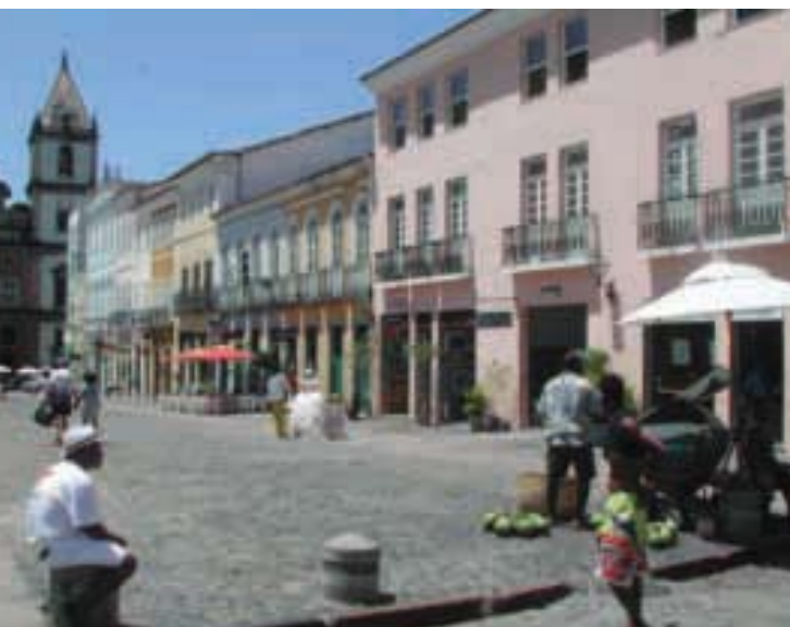
Building social, economic and environmental interventions into city planning.

ceived paternalistic culture, where associates benefit from personal relationships. Beneficiaries were resistant to the idea of making payments on their homes, and due to lack of municipal administrative capacity it is still not clear exactly how many families are not making payments. It is difficult to earn the trust of the locals, since empty promises are often made, especially during elections. Representatives from COMOB identified opportunism as a particular challenge. They describe situations in which locals disputed the assessed values of their old homes, the measurements of their home, or even the size of their family, often resulting in the last minute renegotiation of terms. Regarding vocational training, difficulties in finding work after graduation and supply shortages have caused feelings of frustration among beneficiaries. Finally, COMOB points out that bureaucratic inefficiencies leading to delays in the work programme have caused suspicion and doubt among beneficiaries.