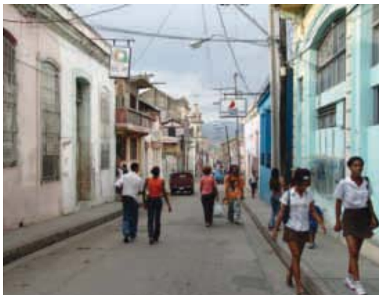
Street scene in Havana, Cuba.

In some countries, public participation is written into the national constitution, for example, Thailand, Sections 76 and 78 of the Constitution. Legislation may also be used to ensure that the public is part of the city administration's decision-making processes and actions.