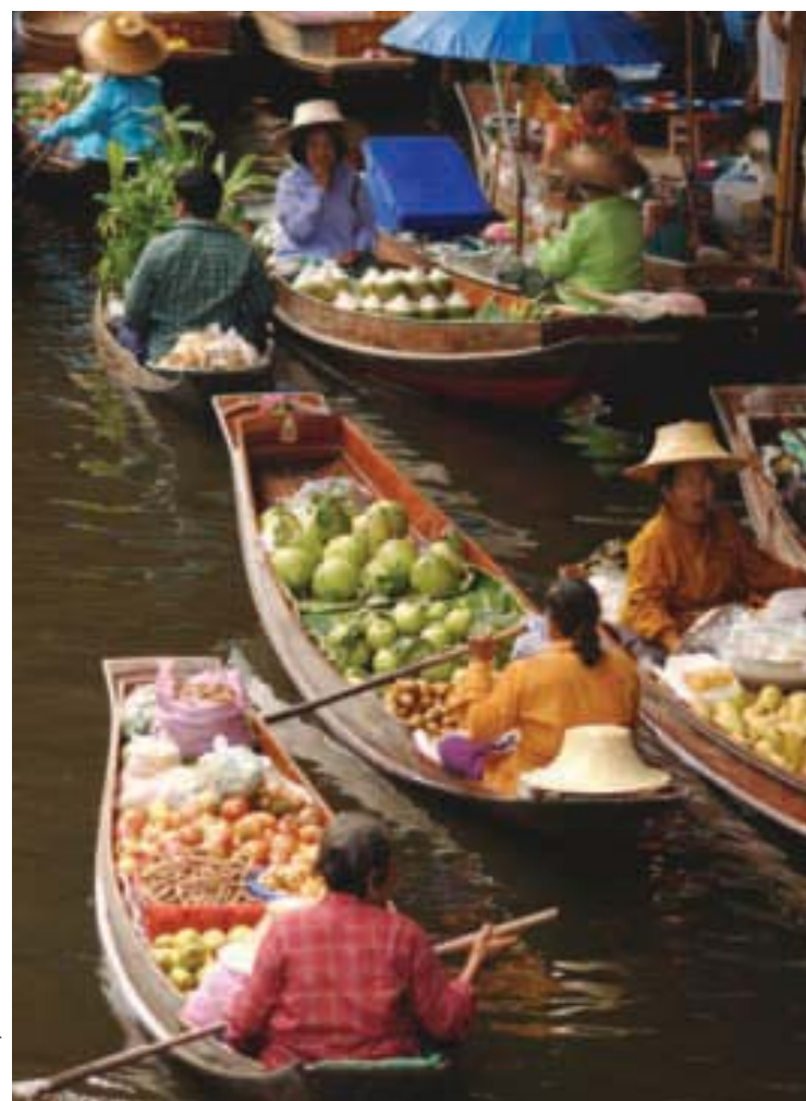
River boat market women plying their goods in Bangkok.

projects, particularly on air quality management. These volunteers come from schools and communities. In addition, an intensive communications campaign has been carried out in schools and communities, using meetings, printed materials and other media. Factories and other businesses were provided with workshops on cleaner production. The BMA also developed a Green Areas Master Plan which aims to increase green public areas, and through which residents are encouraged to plant trees in their front yards.