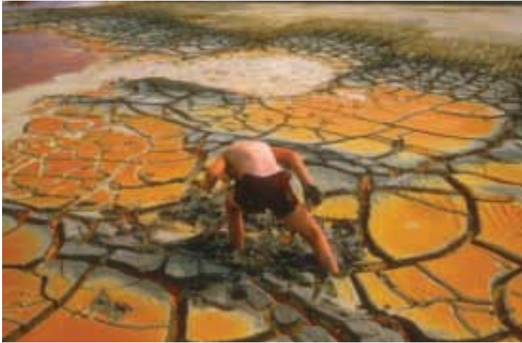
Pollution from copper mine in Bulgaria.

to be effective and efficient, it must consciously integrate the environment into its planning and management mechanisms.