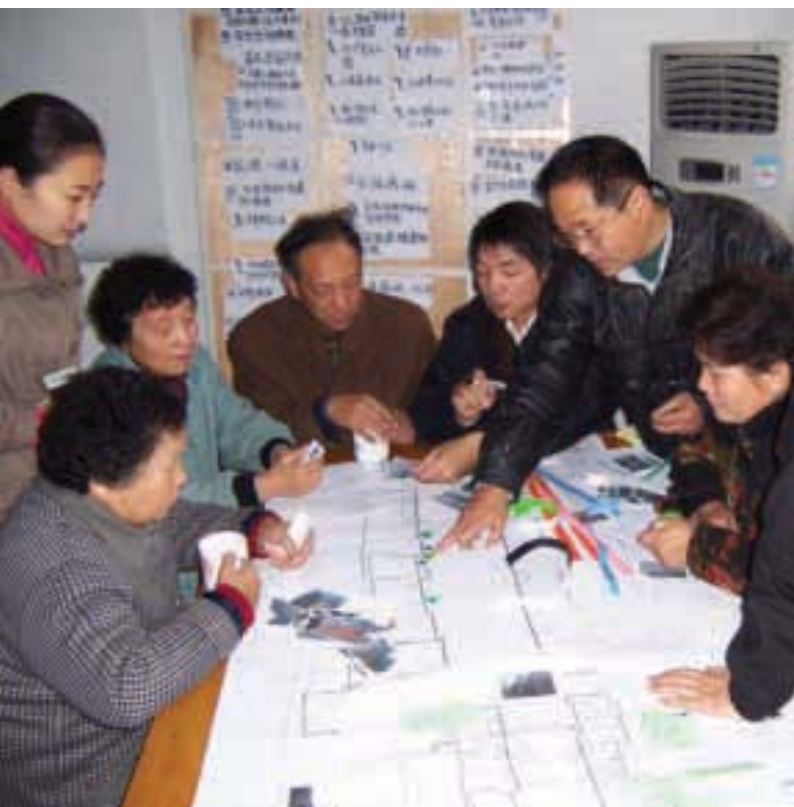
A community action planning (CAP) workshop in Yangzhou, China.

set up environmental information offices to provide the general public with information on environmental issues. Information instruments can also include training, research and development, and awareness raising campaigns. Information campaigns work best to redress a situation where a lack of information about how best to reduce environmental impacts is in itself a significant barrier to people changing their behaviour. Other information instruments can take the form of clearing house mechanisms where communities can learn about other city experiences, such as Germany's "Agenda Transfer" initiative. 2