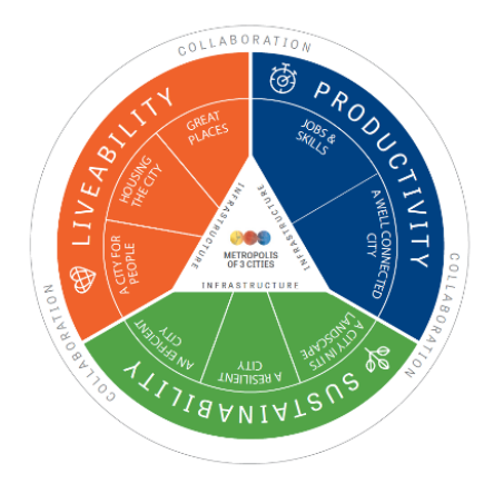
Figure 1. Key themes of liveability, productivity, sustainability + collaboration and infrastructure.

<u>Recommended Action 1:</u> Explicitly recognise that ESD is at the heart of the draft GSRP and District Plans and redraw Figure 1 below (and supporting text) to reflect this.