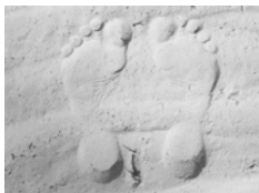
Footprints in the sand