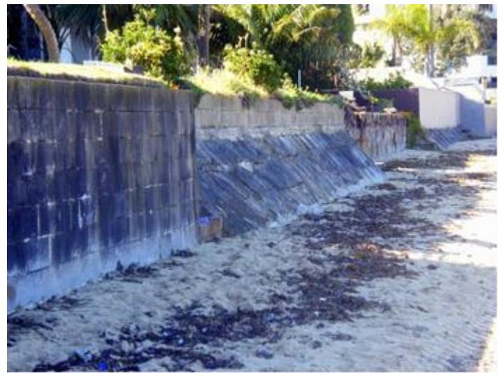
Figure 1: Seawalls along Clontarf Beach, Sydney Harbour Individual seawalls with varying crest and toe heights constructed along a MHW property boundary. They include sloping and vertical structures constructed from brick, lightweight concrete blocks, concrete and stone.

The SCCG is represented by each of the 15 Local Government Authorities in Sydney that have coastal and / or estuarine boundaries: Botany Bay; Hornsby; Leichhardt; Manly; Mosman; North Sydney; Pittwater; Randwick; Rockdale; Sutherland; Sydney; Warringah; Waverley; Willoughby; and Woollahra. SCCG provides a coordinating body with an existing track record of research and coordination on related issues in this region.