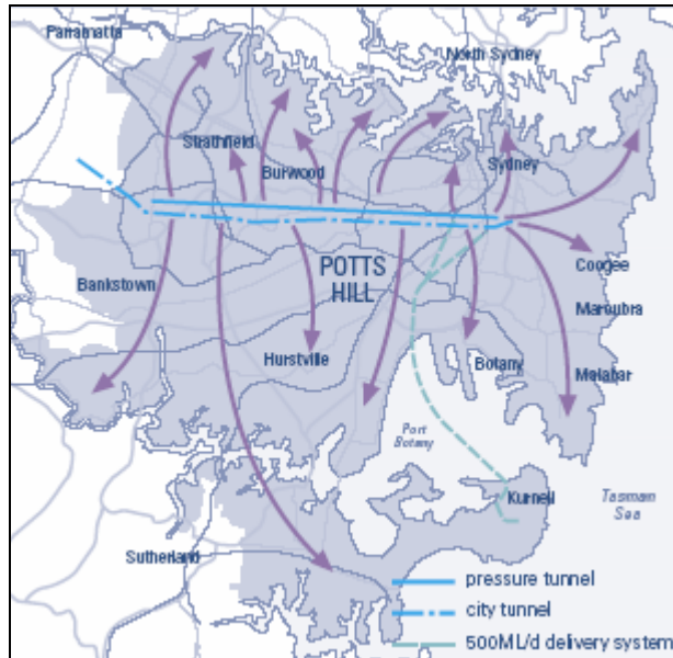
Figure 2. Distribution of desalinated water from Kurnell ( Planning for Desalination 2005 )