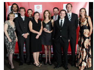
The project team at the Eureka Awards Dinner